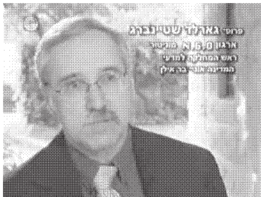
NGO Monitor featured on Israel Channel 1 TV

On November 5, 2007, Israel's Channel One flagship current