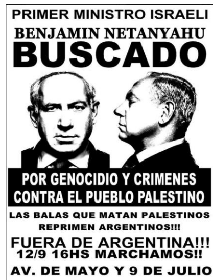
Screenshot 1: http://rotter.net/forum/scoops1/425652.shtml