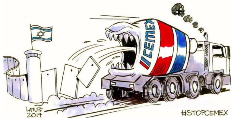
Screenshot 2: https://twitter.com/stopcemex