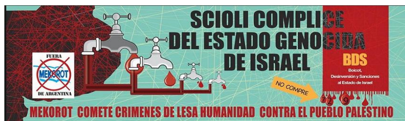
Screenshot 3: https://stopthewall.org/2014/03/07/agreement-mekorot-la-plata-argentina-has-been-suspended

Under the presidency of Nestor Kirchner (and later his wife Cristina Fernández de Kirchner 2003-2015), numerous NGOs – including Federación de Entidades Argentino-Palestinas (FEDERPAL), Organización de Derechos Humanos por Palestina, and the Palestinian organization Stop the Wall , launched a campaign against the Israeli water company Mekorot. In January 2011, Buenos Aires Governor Daniel Scioli announced that "they would tender the building of a regional water treatment plant in La Plata. The contract worth US$170 million was awarded to a consortium of business conformed by the Israeli Water Company MEKOROT, ASHTROM BV (Spanish-Israeli firm) and the Argentinian 5 de Septiembre SA." Between 2011-2014, organizations mobilized against this contract. For three years, " they informed the public about Mekorot's criminal actions in Palestine and investigated the consequences that Mekorot would cause in Argentina...[and] denounced that public Argentinian money would benefit Mekorot and, through this, finance Israeli apartheid in Palestine." The deal was eventually suspended, marking the first boycott campaign in Argentina. (See NGO Monitor's report " Myths vs. Facts: NGOs and the Destructive Water Campaign against Israel .")