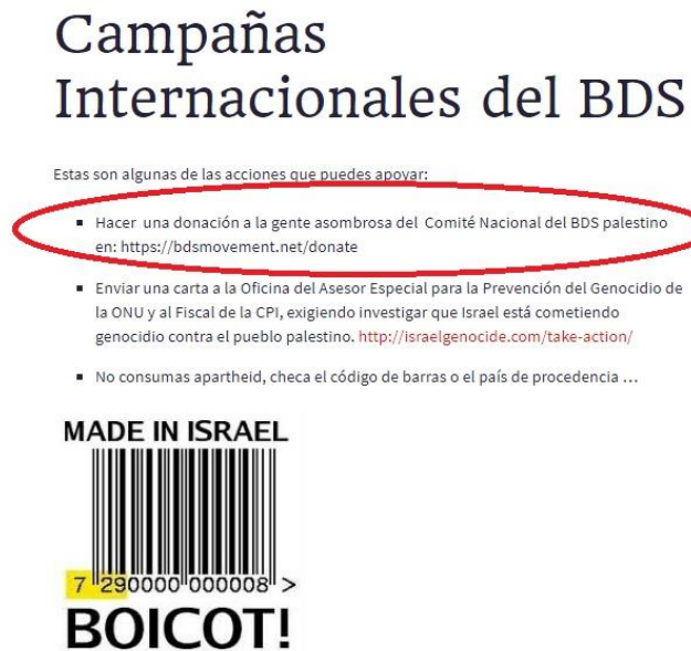
Screenshot 15: https://bdsmexicomx.wordpress.com/campanas-internacionales-del-bds/

BDS Mexico's stated goal is to "overthrow that Zionist ideology that keeps a people prisoner in their land while exploiting it for their own benefit." The group also accuses Israel of " apartheid ," " colonization ," and " ethnic cleansing ."