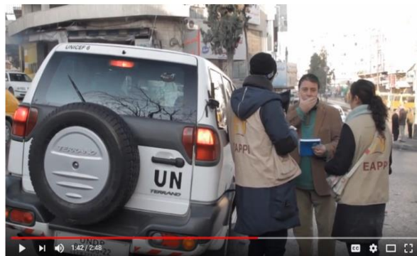
Ecumenical Accompaniment Programme in Palestine and Israel (EAPPI)

Additionally, EAPPI coordinates its work with “other protective presence organizations such as UNWRA, UNOCHA, OHCHR, UNICEF in all placements, TIPH (Hebron), CPT (Hebron, South Hebron Hills), ISM (Northern West Bank, Hebron and South Hebron Hills) and Operation Dove (South Hebron Hills).” 11