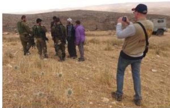
German EAPPI activist monitoring Israeli soldiers

The WCC's EAPPI program consists of a " continuous presence of 25-30 Ecumenical Accompaniers on the ground, for periods of three months in accompanying, offering protective presence, and witness... monitoring and reporting human rights abuses... standing with local peace and human rights groups...and advocacy." According to WCC's International Coordinator for EAPPI Dr. Owe Boersma, the monitoring component includes "a lot of administrative work which is fed into UN systems " (emphasis added). EAPPIs from some or all countries are provided with a living allowance (for food, short travel, etc.); round-trip airfare from their host country; communications expenses; and accident, travel, and medical insurance. 3