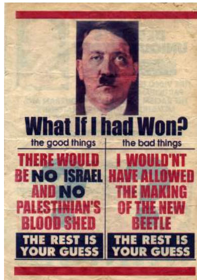
A poster used at the 2001 Durban conference (on file with NGO Monitor)