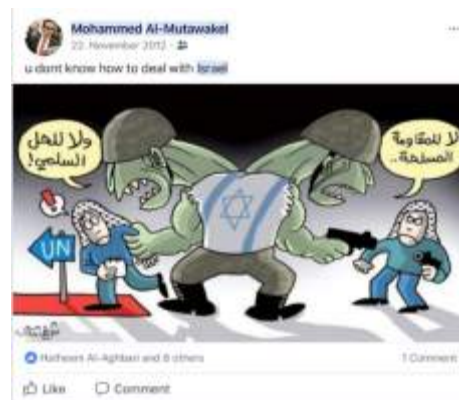
Mohammed Al Mutawakel’s Facebook post from November 22, 2012