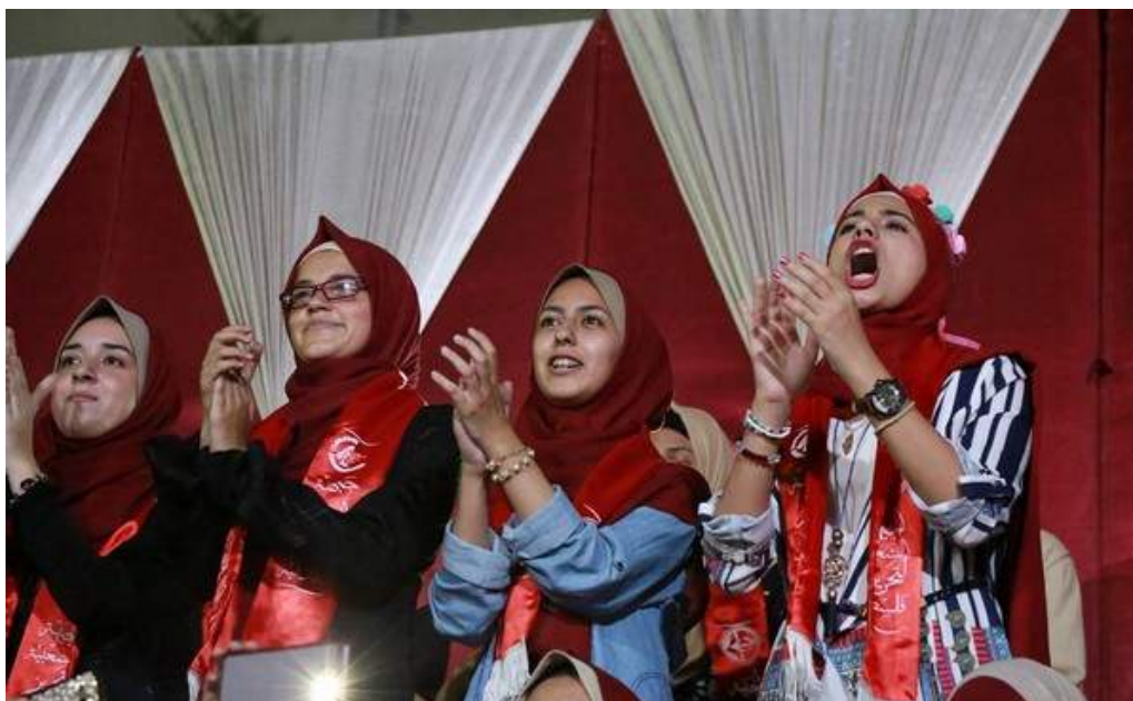
Figure 3: Students at the event dressed in PFLP garb.

The PFLP has repeatedly praised, glorified, and encouraged children to participate in the Palestinian “stabbing intifada” against Israeli civilians.