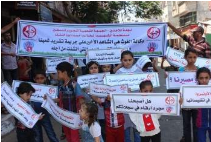
Figure 4: Source: PFLP, “UNRWA crisis is being manufactured to liquidate refugees’ rights,” August 9, 2015:

Hamas regularly recruited and used children in the context of the violence on the Israel-Gaza border that began in March 2018. For example: