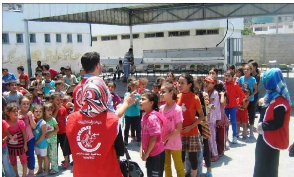
Figure 2: Source: PFLP, "We are All Resistance" campaign supports families and children," August 12, 2014: http://pflp.ps/english/2014/08/12/we-are-all-resistance-campaign-supports-families-and-children/

For instance, in August 2014, the PFLP terror group launched the " we are all resistance " campaign to provide "psychosocial support for children in shelters and distribution of aid to displaced people" in Gaza." Members of the campaign visited UNRWA schools, with the PFLP "volunteers" working to support a collective vision of resistance." This campaign placed vulnerable children in proximity to terror operatives and was clearly aimed at recruiting children to the PFLP.