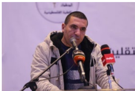
PFLP Prisoners Committee Official Ka'abi speaking in front of the PNGO logo.