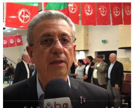
Mustafa Barghouti interviewed.